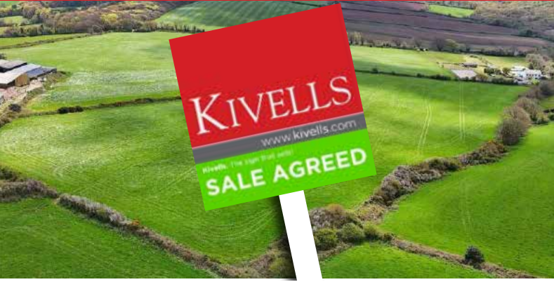
Approx. 57 acres of productive pasture land, gently sloping and south facing. Locacted in a rural location with stunning views, road frontage and access and natural water available.

Holsworthy Farms & Land Agency Farms@kivells.com | 01409 259547